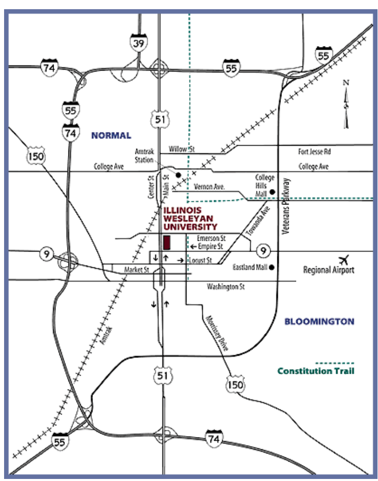
Bloomington City Map