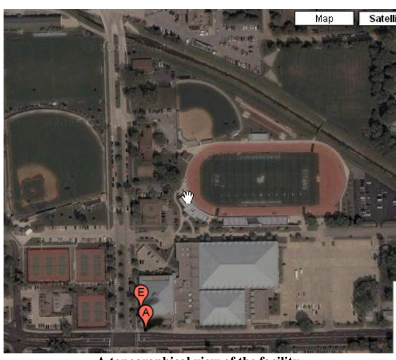
A topographical view of the facility.